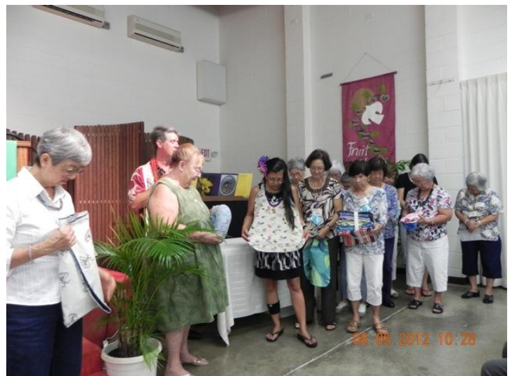
Special gifts made especially for care homes with love from KCC.